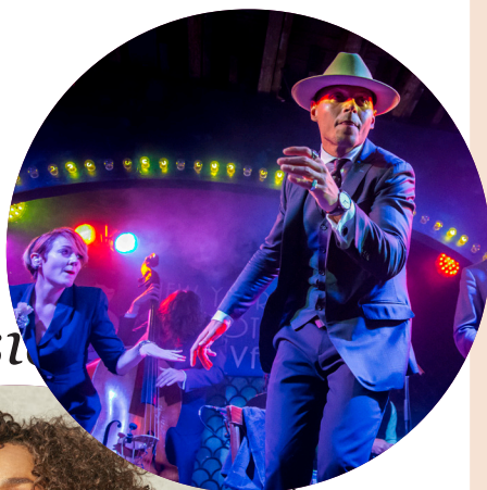
THE HOT SARDINES